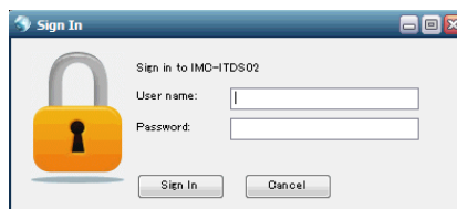
Fig3. Go-Global account

You can access CMAXS from “Programs on cmaxs.com” on desktop.